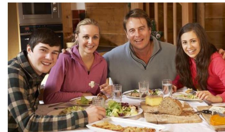
Family meals create an opportunity for connection

Pursue family meals together. I know we're all busy, and sometimes we're too busy to get everyone together for a meal.